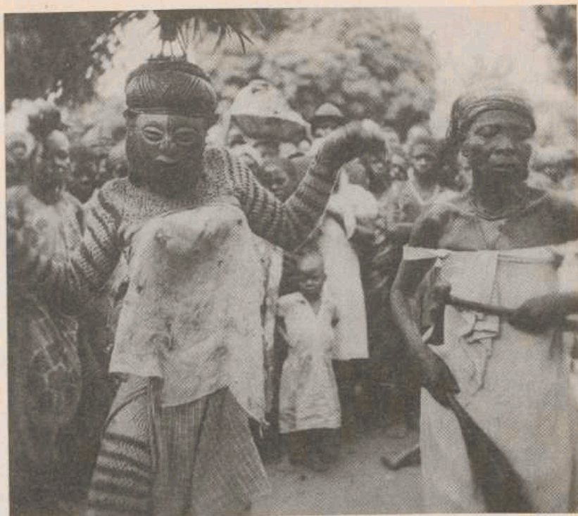
Fig. 5: Although their upper body is wrapped in a piece of cloth, it may be assumed that these ( Mwana ) Pwo mask dancers had wooden breasts attached to their bodysuits.