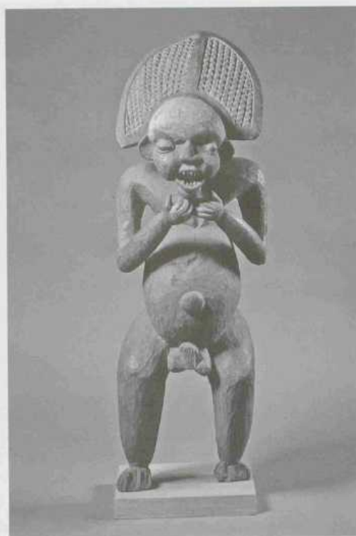
Fig. 14: Male figure, Bangou. Cameroon, 19th century. Wood; height 90.5 cm. Ethnologisches Museum Berlin, inv. no. III C 21058