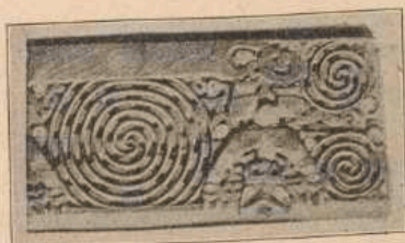
Fig. 8. Carved ornaments for doorways. Maori.